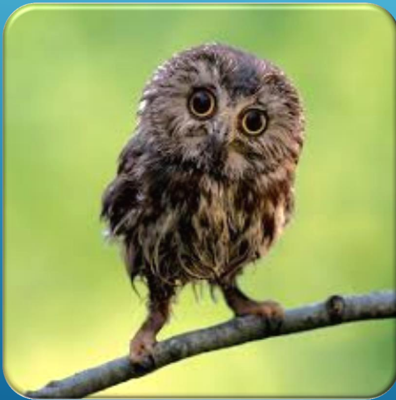
Juvenile Saw-whet Owl

Together we can prevent the applications to develop Saw-whet from being approved.